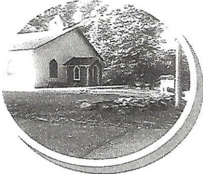
800 Mt. Lebanon Road Wilmington, Delaware 19803 (302) 652-8411