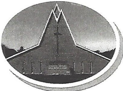
2619 Foulk Road Wilmington, Delaware 19810 (302) 475-3549